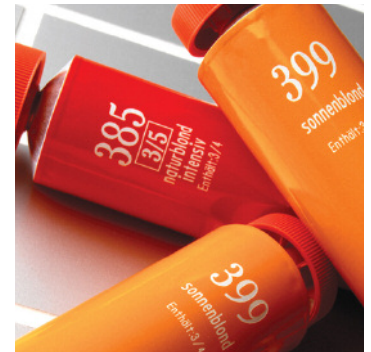
Various high quality fonts and mark field options