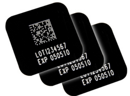
Versatile coding options including 2D codes