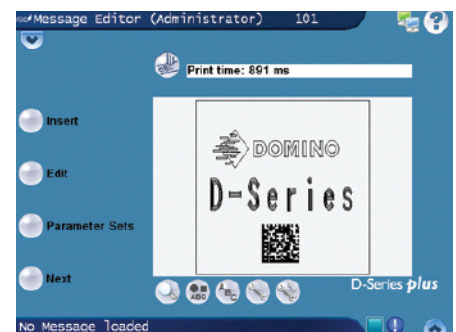
Easy to use intuitive interface